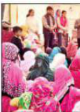
सोसाइटी फॉर एनाइड स्टडीज

सोसाइटी फॉर एनाइड स्टडीज ने सेंसिटाइजेशन मीटिंग का किया आयोजन।